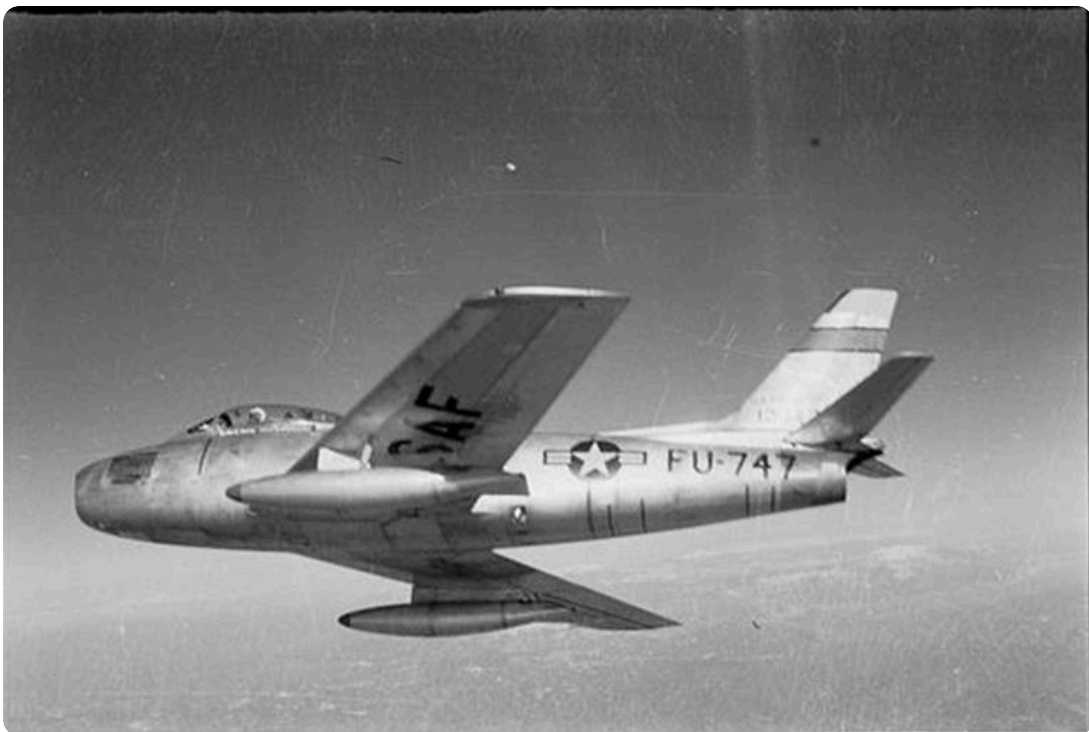
...and here flying his F-86 Sabre.