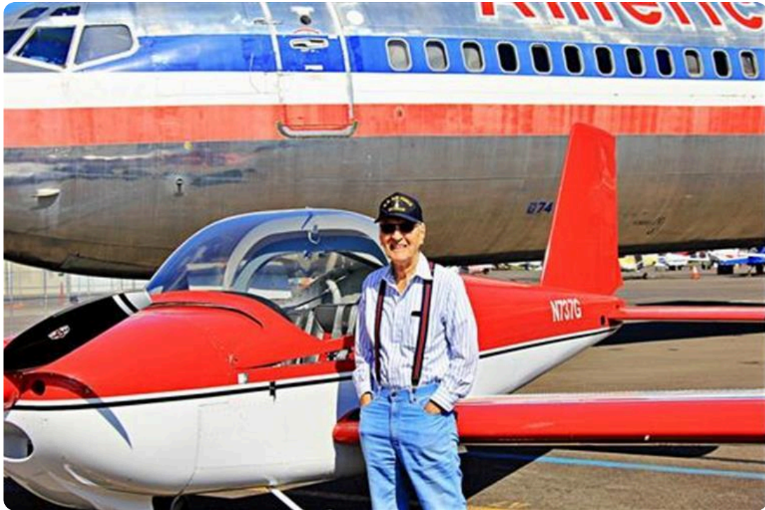
After I gave him a ride in my airplane